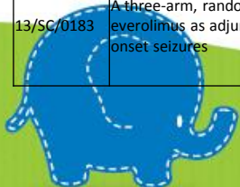
Table 2 of 2